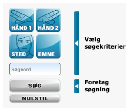
Figure 1: Traditional search functionality as seen in the online Danish Sign Language dictionary (Center for Tegnsprog, 2008).

The paper is structured as follows: in Section 2 we give an overview of methods that utilize Dynamic Time Warping in the gestural and sign language domain. In Section 3 we describe our methodology regarding the extraction of the body joint coordinates as well as the experimental setup, analysis, and visualization tool. In Section 4 we present the results of our experiments. We discuss them in Section 5 and conclude and motivate future research in Section 6.