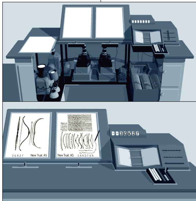
Ian Adelman and Paul Kahn/Dynamic Diagrams, Inc.

every one of a large set of items, and by picking out those which have certain specified characteristics. There is another form of selection best illustrated by the automatic telephone exchange. You dial a number and the machine selects and connects just one of a million possible stations. It does not run over them all. It pays attention only to a class given by a first digit, then only to a subclass of this given by the second digit, and so on; and thus proceeds rapidly and almost unerringly to the selected station. It requires a few seconds to make the selection, although the process could be speeded up if increased speed were economically warranted. If necessary, it could be made extremely fast by substituting thermionic-tube switching for mechanical switching, so that the full selection could be made in one one-hundredth of a second. No one would wish to spend the money necessary to make this change in the telephone system, but the general idea is applicable elsewhere. Take